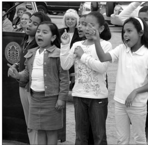
Third graders from Logan Heights Elementary perform at the groundbreaking.

The Logan Heights Branch Library serves a community that is 68 percent Hispanic. The Library is designed to be a place where all residents can celebrate their cultural heritage. A “Centro Cultural” community galleria/exhibit area will provide space for special events and enrichment and learning activities. The book collection will grow by 80 percent and will feature the San Diego Public Library's largest Spanish-language collection.