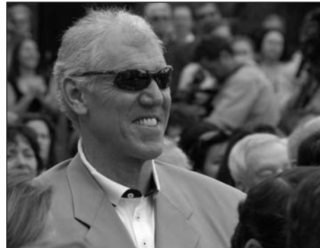
Walton at the New Central Library groundbreaking.

I f you heard Bill Walton speak these strong words out of context, you might think he was talking about an NBA Championship. That would mean you didn't really know Bill Walton.