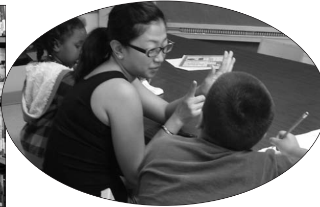
A volunteer tutor helps students with their math homework at the Mountainview/Beckwourth Branch Library.